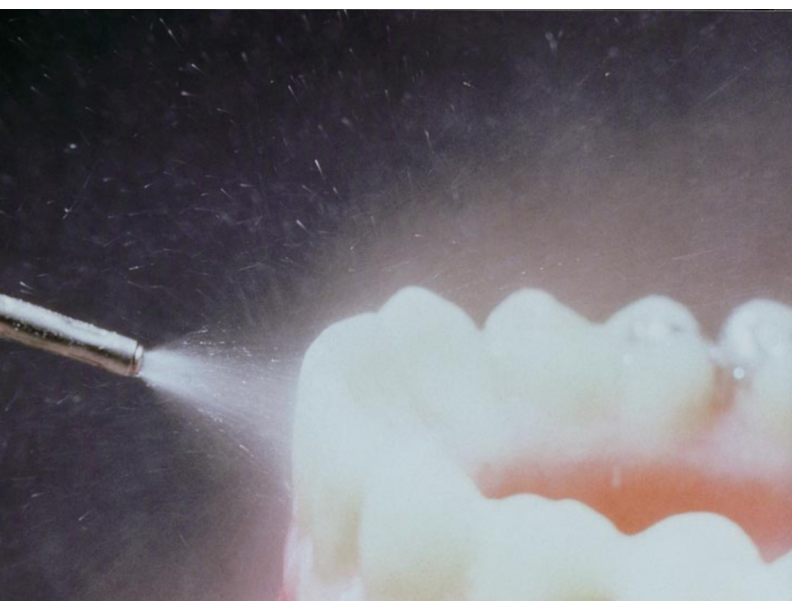
Figure 2. The visible aerosol cloud, made up of water and abrasive at the levels recommended by the manufacturer, produced by an air polisher.

was based on the assumption that all patients may have an infectious bloodborne infection, such as with hepatitis B virus, hepatitis C virus and HIV. It also should be assumed that all patients may have an infectious disease that has the potential to be spread by dental aerosols; thus, universal precautions to limit aerosols also should be in place.