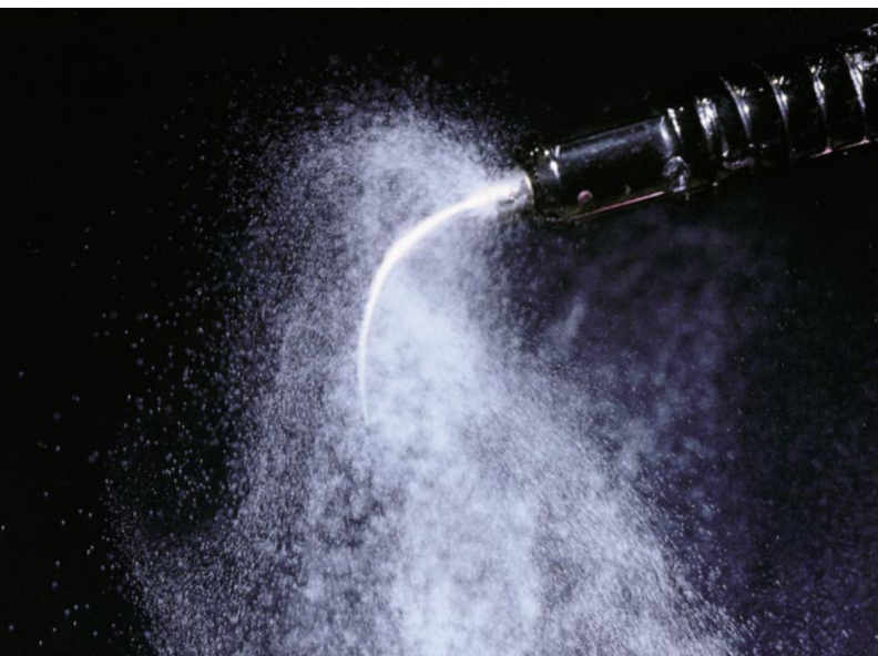
Figure 1. The visible aerosol cloud produced by an ultrasonic scaler using a flow of 17 milliliters per minute of coolant water.